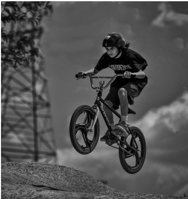
Third Place: “Fear” By Saul Pleeter